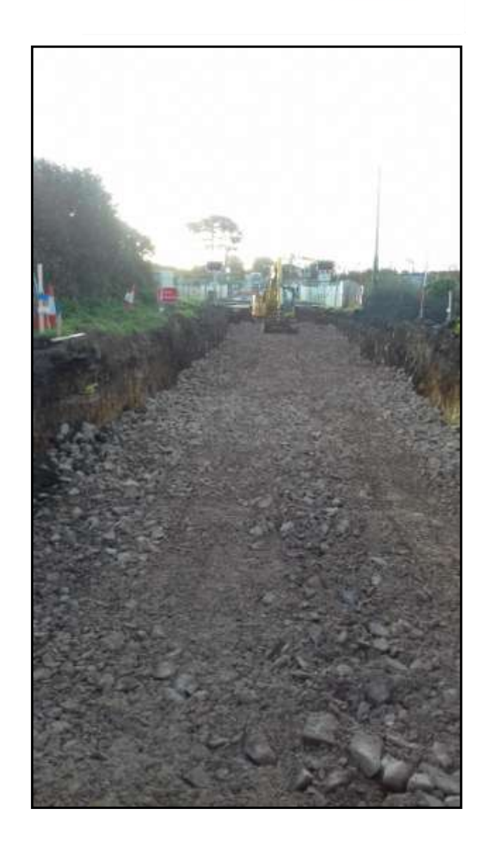
The excavation of the North section is almost complete. Capping stone has been laid ready for compaction